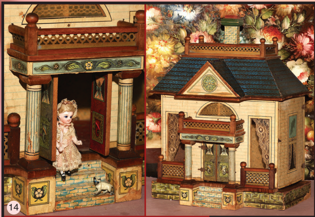
14) Important Bliss French Villa - Early 'Blue Roof' model (inquire), twin salons with 9.5" ceilings; clean Original Papers inside and out! Lovely condition, 16"x 10"x 22" tall w/ rare Chimney. $1650