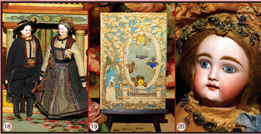
18) Mint & Original 1860's China Pair - exquisite 7.5" Miniature Couple w/ orig. porc. limbs; very special faces & multiple brush mark hair. Layers of detailed Factory Clothing! Blue Ribbon worthy. $1495 19) Early 1860's Valentine w. Envelope - lovely 5" by 7" silver and gold Tracery on Blue Silk w. Still has pretty embossed envelope! $69