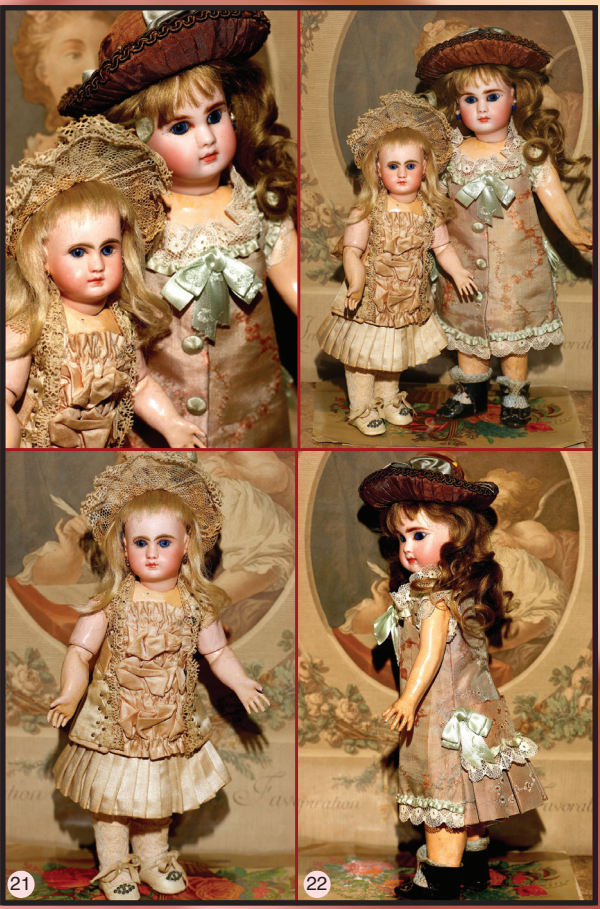
21) Extremely Rare 8" Factory Original Bebe Steiner - Size '0' - w. Fully Jointed Stiff Wrist Sgnd Body, Factory Pate & Wig, Factory Original Silk Dress & matching wire frame Orig. Bonnet & Shoes! Precious! $3495