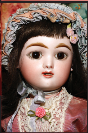
16) A fine quality 20" Eden Bebe - the early "Sweet Faced" model w. dreamy PWs w/ lacy lashes, soft multi-stroke brows, fully sgnd. head w/ cork pate, mint orig. Jtd. body. A Petit Four in pink! $2250: All Bisque Kestner '150'- All Original 5.5" vintage Clo/Mo Sweetheart! $195