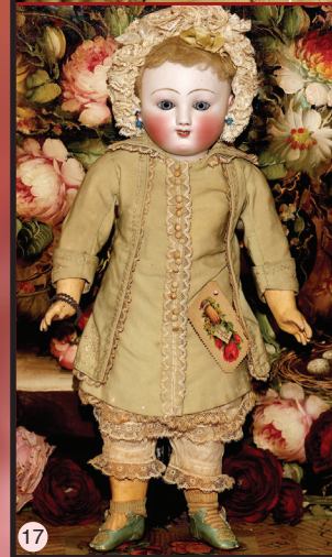
17) All Original 19" Moon Face Steiner - Earliest Steiner Bebe, goat skin wig, perfect teeth, mint pale bisque with original jtd. Stiff Wrist Body and Original Period Clothes & Shoes. Museum worthy rarity. $7900