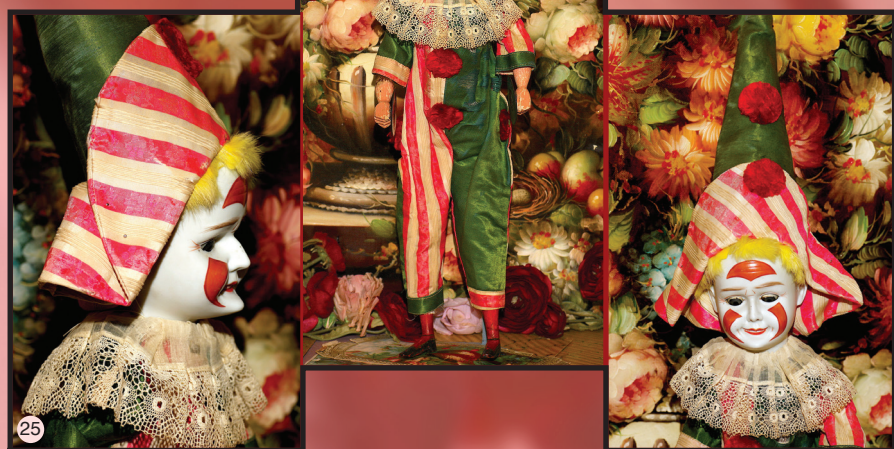
25) Stunning Bisque Head Jester in Brilliant Factory Silks - 20" tall, w. Orig 9" Pointed Silk Hat & Wig; Extreme Character Modeling for this size doll. An opulent Polichinelle impossible to find. Total luxury! $1800